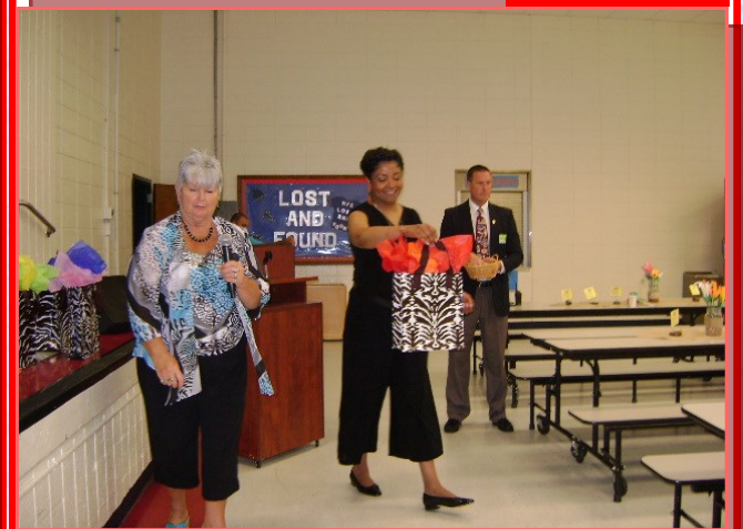
Field Day 2014