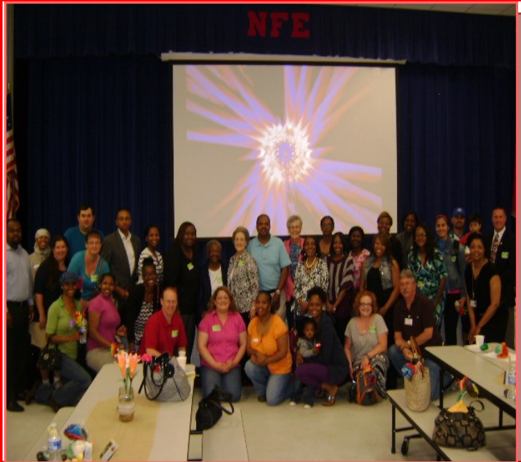
Volunteer Breakfast 2014 “Our Volunteers Rock”